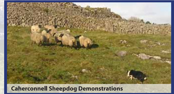
Caherconnell Sheepdog Demonstrations