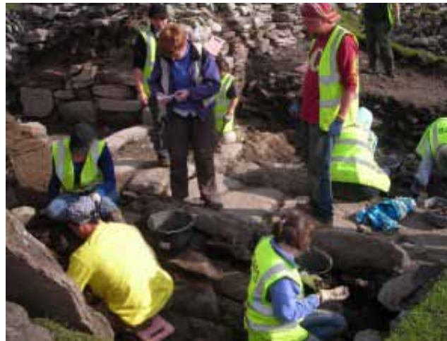
Students at work at Caherconnell Archaeological Field School