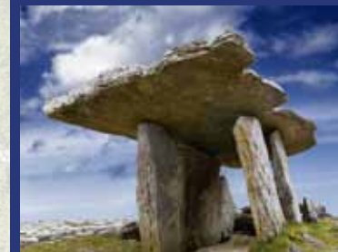
Poul nabrone Dolmen

A megalithic burial tomb, it is the Burren's most famous archaeological monument. It was excavated in 1986. The remains of 33 people were discovered, some dating back to 3000 BC. Our audio visual presentation is a must see before visiting this monument.